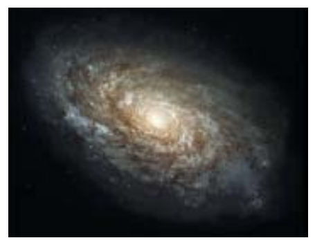
Figure 1. NGC 4414, a typical spiral galaxy is 60 million light-years away, about 100,000 light-years in diameter, and contains hundreds of billions of stars.